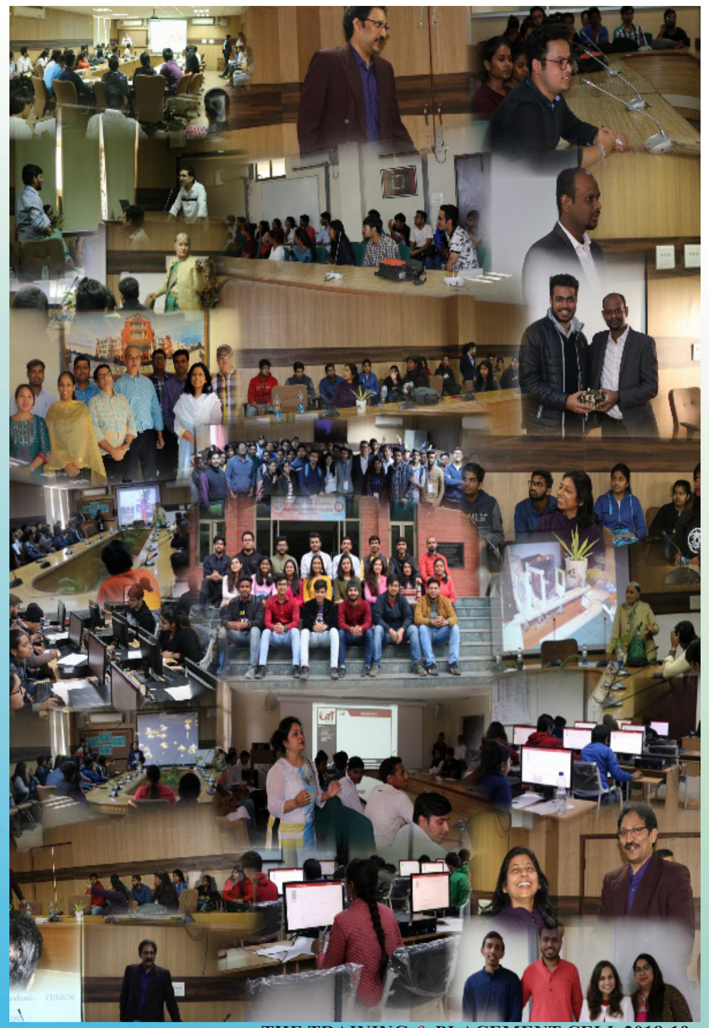
THE TRAINING & PLACEMENT CELL 2018-19