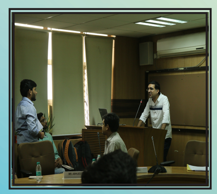
THE TRAINING & PLACEMENT CELL 2018-19